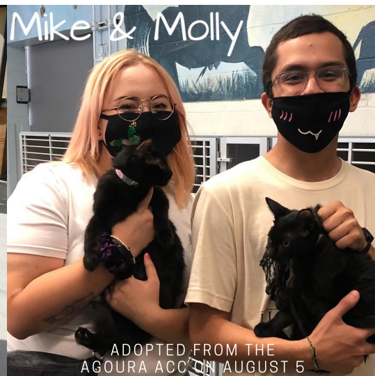
ADOPTED FROM THE AGOURA ACC ON AUGUST 5