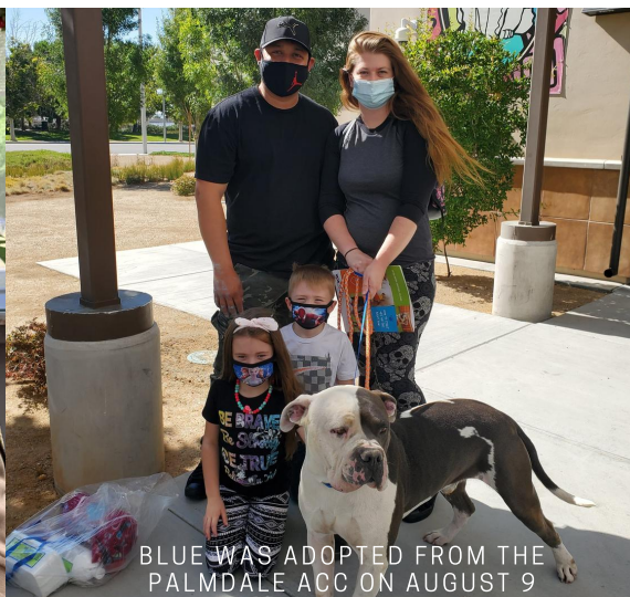
BLUE WAS ADOPTED FROM THE PALMDALE ACC ON AUGUST 9