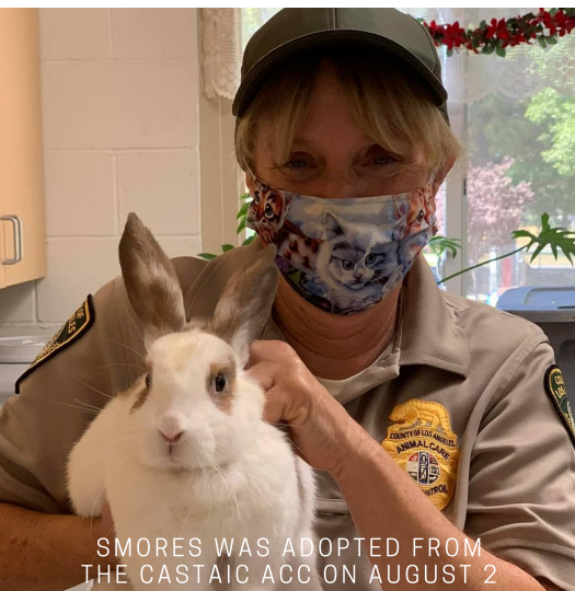
SMORES WAS ADOPTED FROM THE CASTAIC ACC ON AUGUST 2

License Fees (may vary depending on where you live)