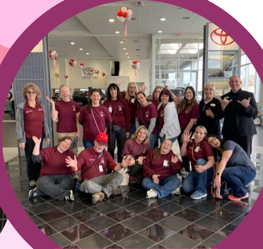
Toyota Adoption Event PAGE 3