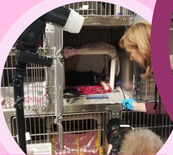
Downey Photoshoot PAGE 2