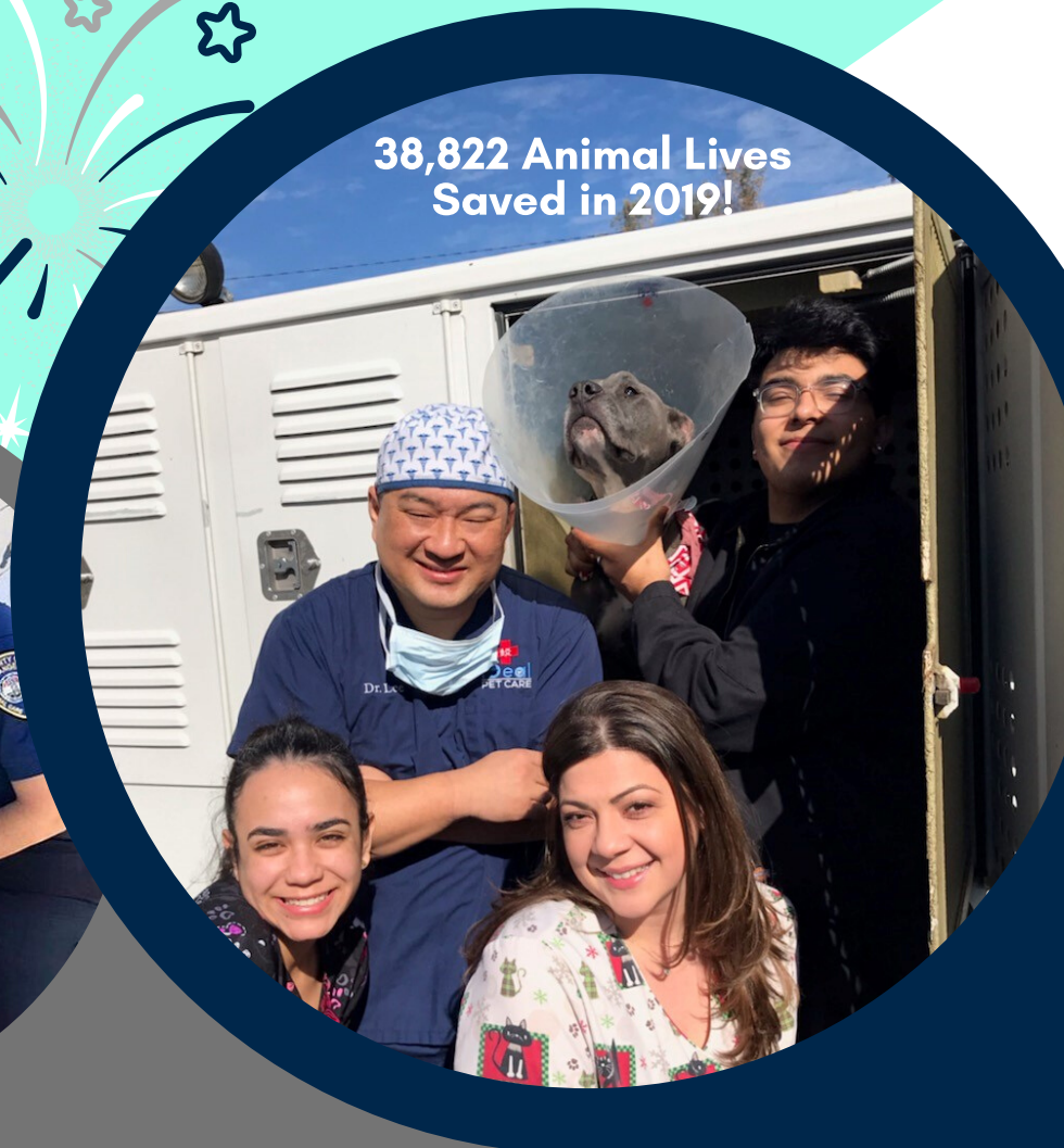
38,822 Animal Lives Saved in 2019!