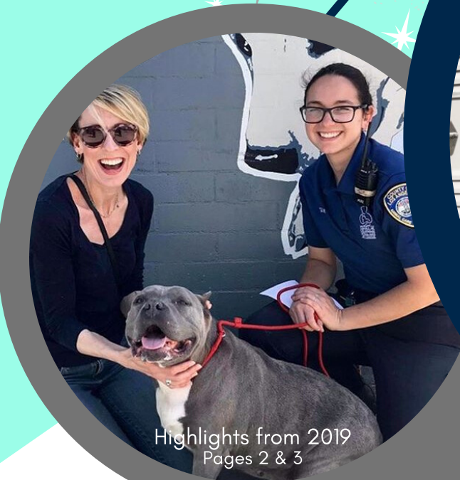
Highlights from 2019 Pages 2 & 3