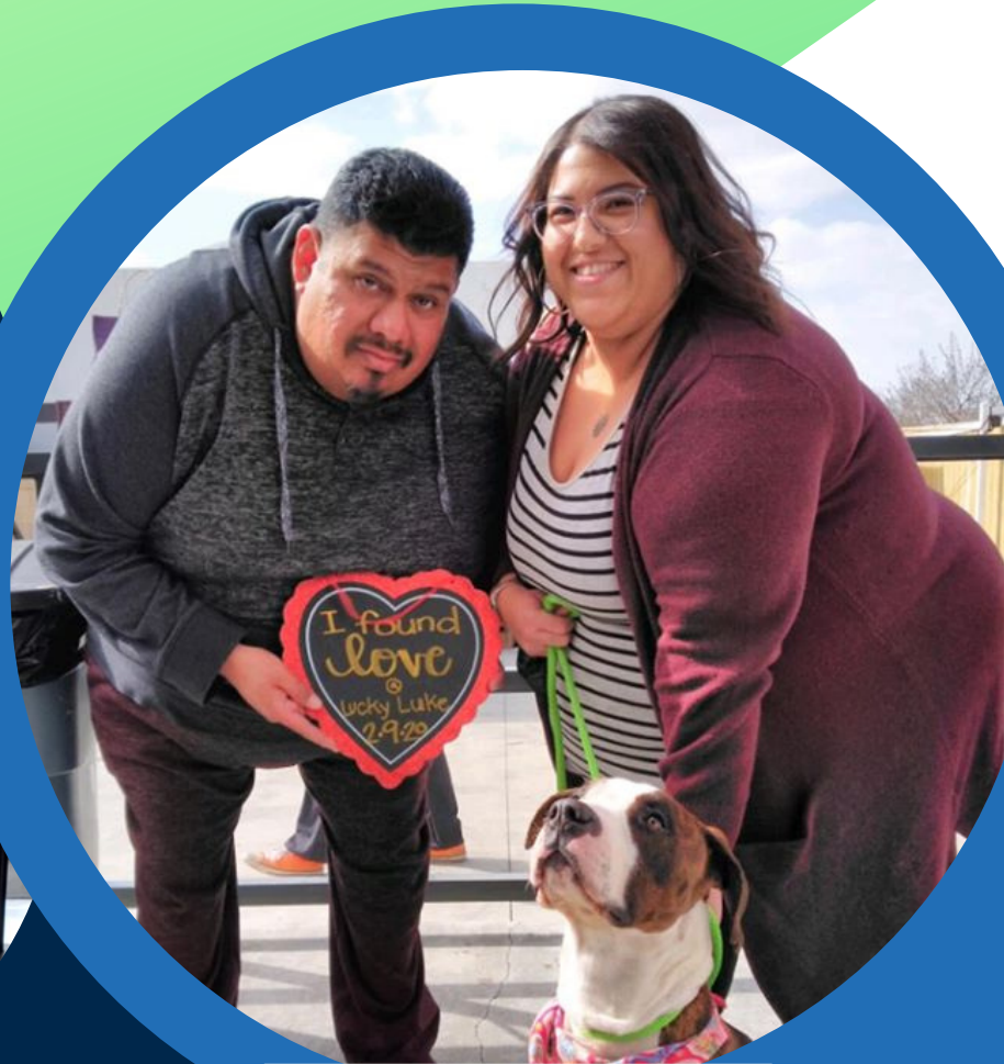
Lucky Luke Adoption Event PAGE 3