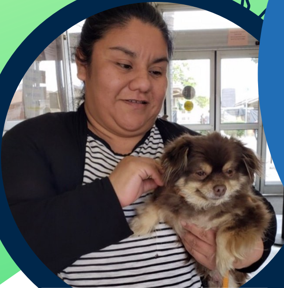
Gornak Reunited PAGE 4