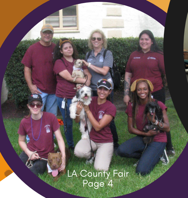
LA County Fair Page 4