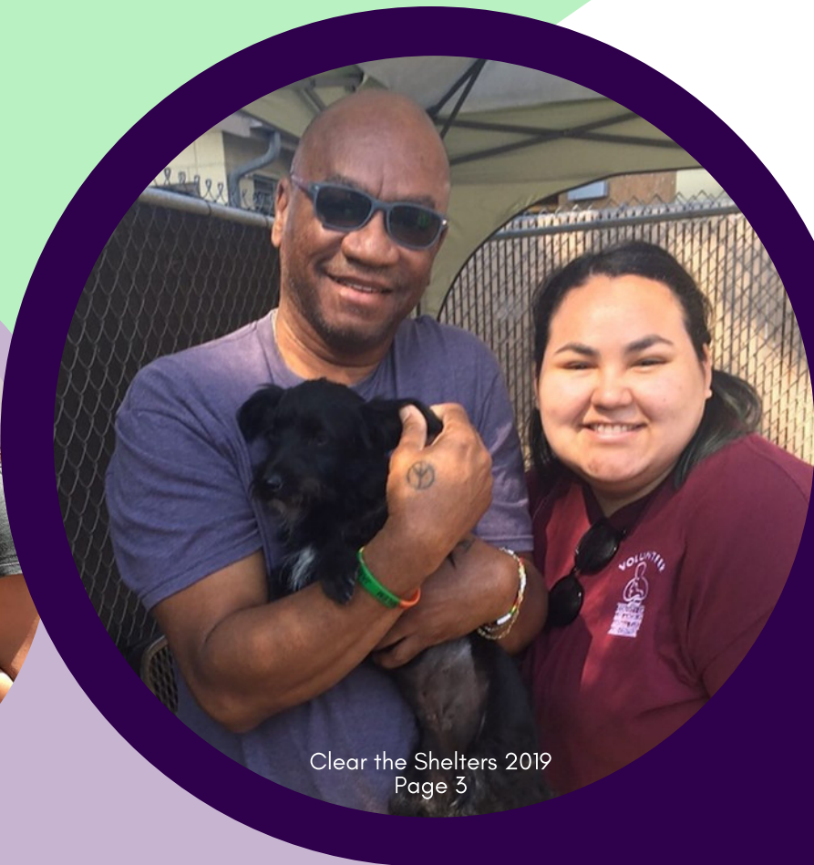
Clear the Shelters 2019 Page 3