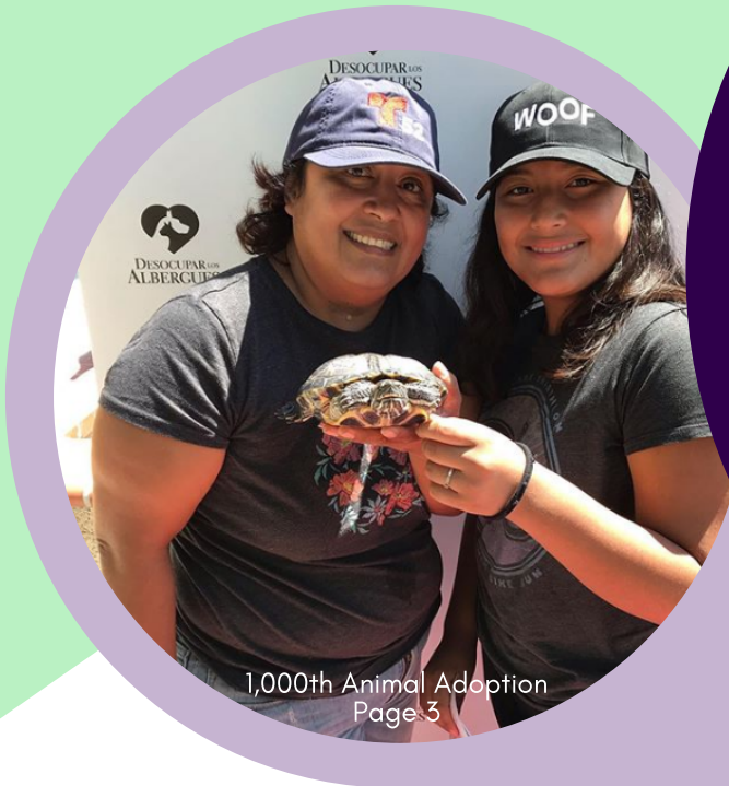
1,000th Animal Adoption Page 3